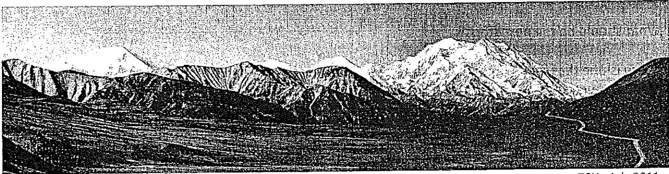
Denali National Park – Mt. McKinley Panorama